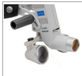
Adapts to any Binocular Loupes of Zumax