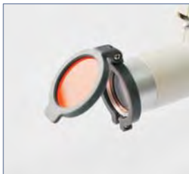
Yellow Filter Optional